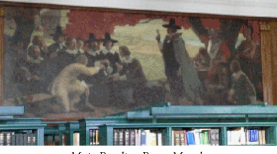
Main Reading Room Mural

History: The Cleveland Law Library was originally established in 1869 by the Cleveland Law Library Association (CLLA), a non-profit organization created by leading members of the bar in Cuyahoga County for the promotion of the science of law. Over the course of time, Ohio statutes carved out an additional role for the Cleveland Law Library in serving the local judiciary, elected officials in Cuyahoga County, and members of the Ohio