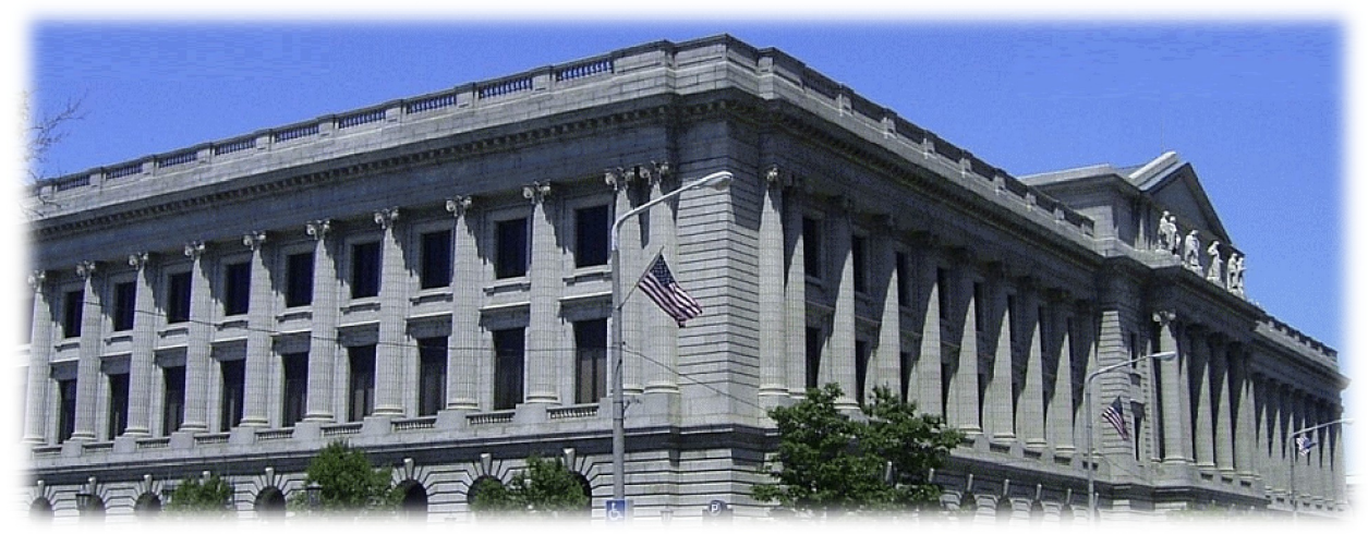
The Cleveland Law Library is located on the 4<sup>th</sup> floor of the Cuyahoga County Courthouse.