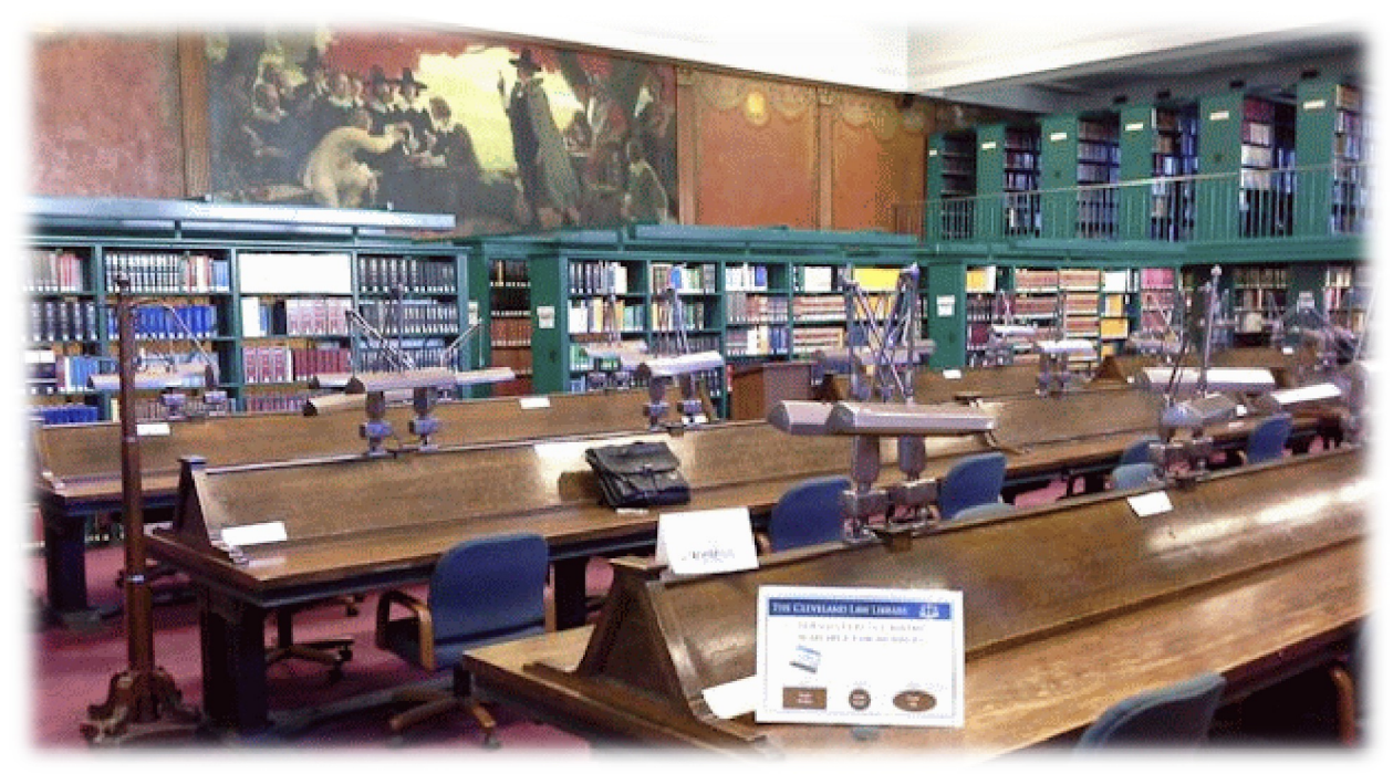
Main Reading Room

This year, the Cleveland Law Library implemented many of the important suggestions from the Fall Retreat. As the timeline contained later in this report demonstrates, some initiatives started much earlier in the strategic planning process, and some will take additional time and ongoing effort.